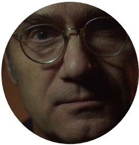
Whitney Dow Filmmaker

Has performed in all five boroughs of New York City and a number of colleges Has collaborated with rapper Awkwafina, punk band PWR BTTM and spoken word duo DarkMatter Created solo show FRESH OFF THE BANANA BOAT which sold out at Dixon Place's HOT! Festival