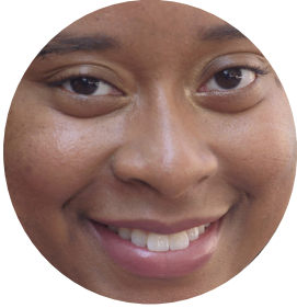
Phoebe Robinson Comedian, Writer & Actress

Author of NYT Best Seller You Can't Touch My Hair