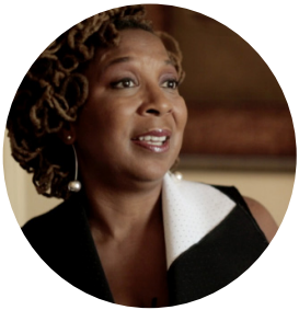
Kimberlé Williams Crenshaw Professor

Writer and star of MTV'S Decoded Stand-up set The Meltdown at the NerdMelt Showroom Featured on podcast for Cave Comedy Radio