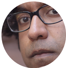
Hari Kondabolu Comedian

NYT has called him “one of the most exciting political comics in standup today”