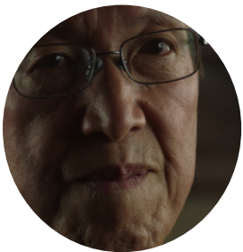
Derald Wing Sue Psychologist

Has appeared on Nightly Show, Gotham Comedy Live, Comic View, One Mic Stand and Celebrities Undercover Featured in NYT, O Magazine, Black Enterprise, Time Out NY and Brooklyn Magazine Involved with the New York Comedy Festival, Brooklyn Comedy Festival, Hoboken Comedy Festival, SoCal Comedy Festival and American Black Film Festival Comedy Contest