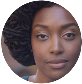
Franchesca Ramsey Comedian & YouTube Personality

Host of MTV News web series Decoded Former writer and contributor for The Nightly Show with Larry Wilmore on Comedy Central Featured on MTV, The New York Times, NPR, Ebony Magazine and The BBC