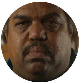
Daryl Davis Activist & Musician

Creator of The Whiteness Project His film Two Towns of Jasper won numerous awards including a Peabody Award, duPont Award, and an Anthony Radziwill Documentary Achievement Award Exhibited at The Met, MoMA, Smithsonian