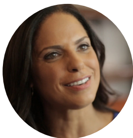
Soledad O'Brien Journalist, Documentarian & Executive Producer